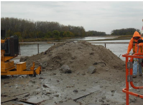
October 22, 2015 – Photo showing example of debris removed from Pier #5.