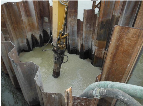
October 22, 2015 – Photo showing final demolition of Pier #5.