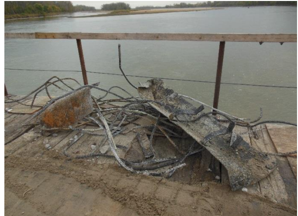
October 22, 2015 – Photo showing steel reinforcement removed from Pier #5.