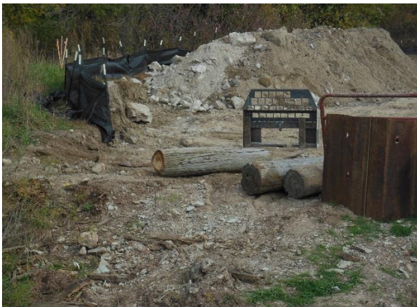
October 22, 2015 – Photo showing cut off bollards.